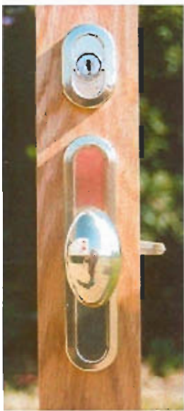
Oval Knob with optional deadbolt