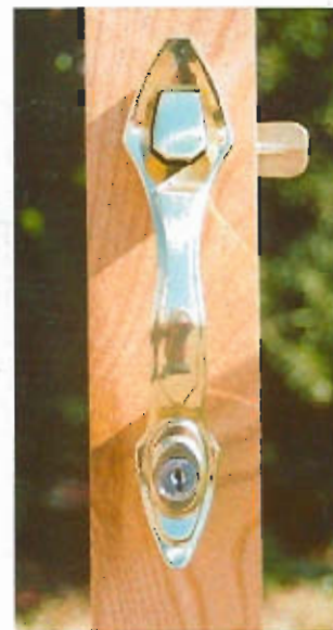
Quincy Pushbutton with deadbolt