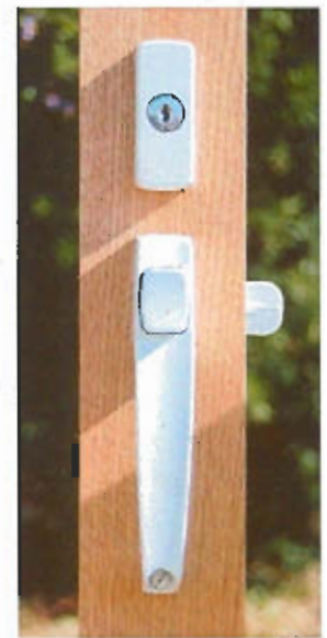
Cumberland Pushbutton with optional deadbolt