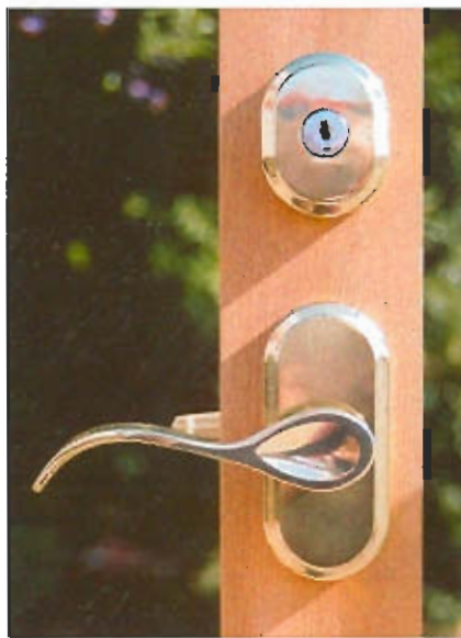
Contemporary Lever with optional deadbolt